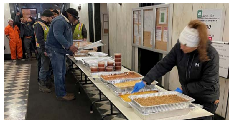
Safety Appreciation Luncheon